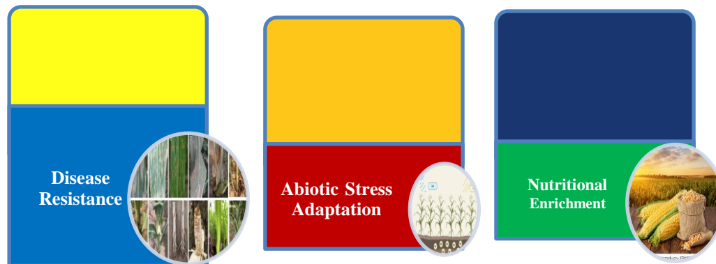
Figure 3: Applications of Genetic Diversity in Sustainable Maize Agriculture

The rich genetic diversity within maize populations holds immense potential for addressing the multifaceted challenges in agriculture (Menkir et al., 2017). This section focuses on the practical applications of harnessing genetic diversity for sustainable maize production. It focuses on its role in conferring disease resistance, adapting to abiotic stress, and enhancing nutritional content (figure 3).