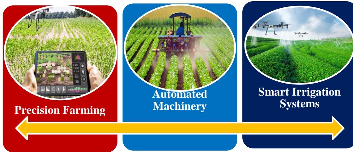
Figure 1: Technological Advancements in Agriculture

security (Kelemu et al., 2015). These innovations, driven by cutting-edge technologies, have paved the way for more efficient and sustainable agricultural practices (figure 1).